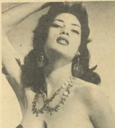
See World's Greatest Shows On Las Vegas Strip