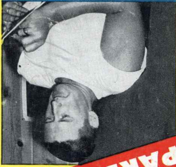
Mickey Spillane: Men's Room Scribbler Lowdown Page 24

I AM A WIRE- TAPPER Page 14 THE PHONY MOVIE MAG RACKET Page 30 WHAT MAJOR LEAGUERS DO AFTER HOURS