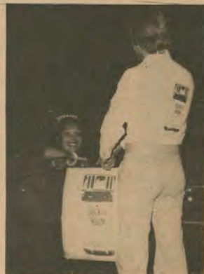
Miss Gay America greeted at Depository in Locker Room powered limosine.