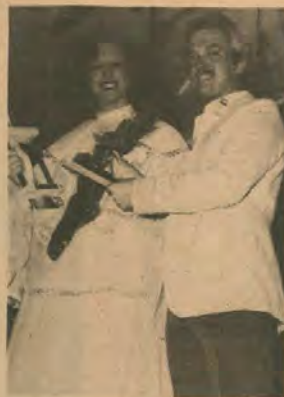
Miss Gay America '75 - '76 is awarded cash prize and trophy in preliminary judging.