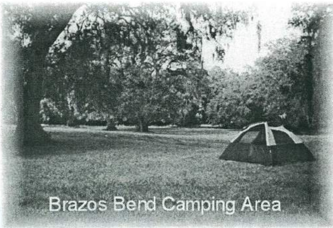
Brazos Bend Camping Area