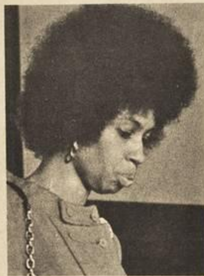
The Hon. Eleanor Holmes Norton