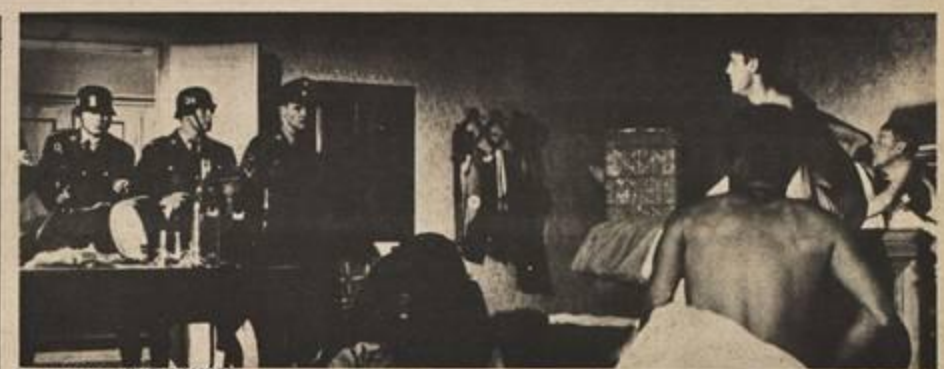
A scene from THE DAMNED

American audiences of sixteen years ago probably believed that seeing Robert Anderson's Tea and Sympathy would be their unique venture into a, to them, "unnatural" world. And naturally that play, more a non-view than view of homosexuality, was a victory for the home team: though they might exist abroad, America had no "homosexuals"—in fact, what was that word again? Moreover, in those pre-civil rights days, Americans were used to believing that the majority was inherently right—for everybody. Today, a multitude of homosexual dramas—pioneered by those from England and Continental Europe—have stolen the entertainment spotlight. Homosexuals realize that producers, directors, backers, and actors are not being purely altruistic in bringing us to light: there are dollars to be earned by an exploration of our passionate, self-contained demi-monde. There is, especially, excitement in our "irregulars"—hustlers, neurotics, transvestites, orgiasts—which makes for good drama and excellent box-office: to wit, Midnight Cowboy , The Boys in the Band and The Sergeant (1968 film about a near-psychotic career man), Fortune and Men's Eyes and The Queen (1968 film in which male homosexuals prepare for a drag show), The Detective (1968 film about the murder of a homosexual and showing an in-truck orgy on the New York docks). Our only regret is that no successful native-American play or film