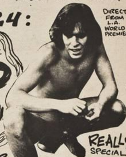
DIRECT FROM L.A. WORLD PREMIER

COLOR Plus "SUPPORT YOUR LOCAL QUEEN" ALSO "BOY IN THE DUNES" (watch out for the road) - COLOR