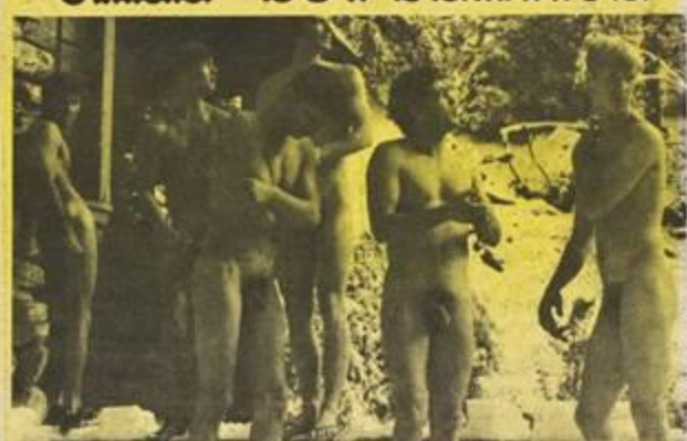
"See the psychiatrist in Section B, but go to Section D first to put your specimen in a numbered tin cup."

discrimination is justifiable (it isn't, but let's not tell the draft board that until after I pass the age of draft eligibility), the Selective Service System is now in possession of an affidavit from you, in which you admit things you'd rather not have known, which could incriminate you, and which could lead to discrimination against you.