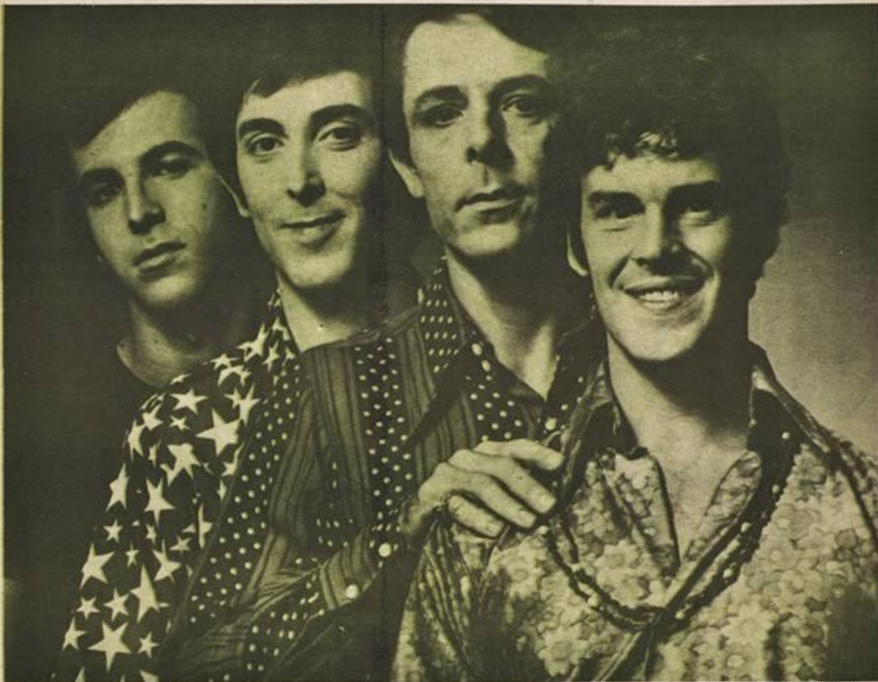
The cast of AND PUPPY DOG TAILS