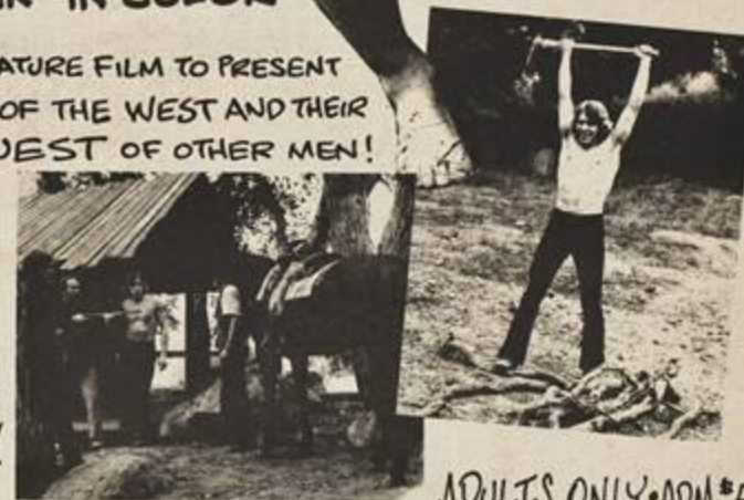
ADULTS ONLY • ADM. $5.