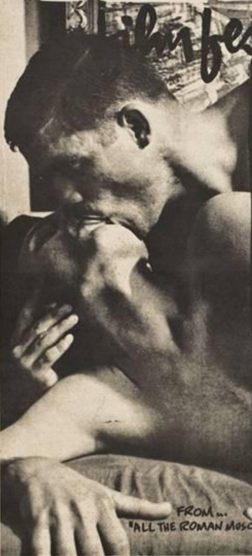
FROM... "ALL THE ROMAN MUSCLES"

A GIANT MALE ADVENTURE AWAITS YOU... FEB. 11-17 ... MIGHTY IN SIZE!