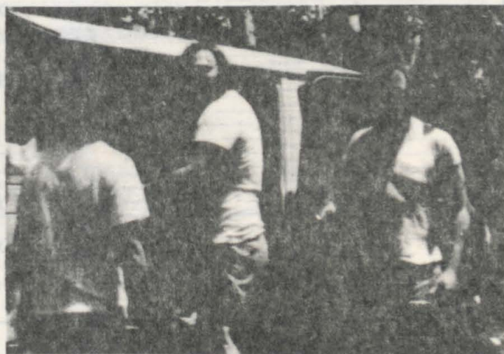
formed by a group billing themselves as "Two Dykes and a Queen." More than 50 persons enjoyed the entertainment and the booze.