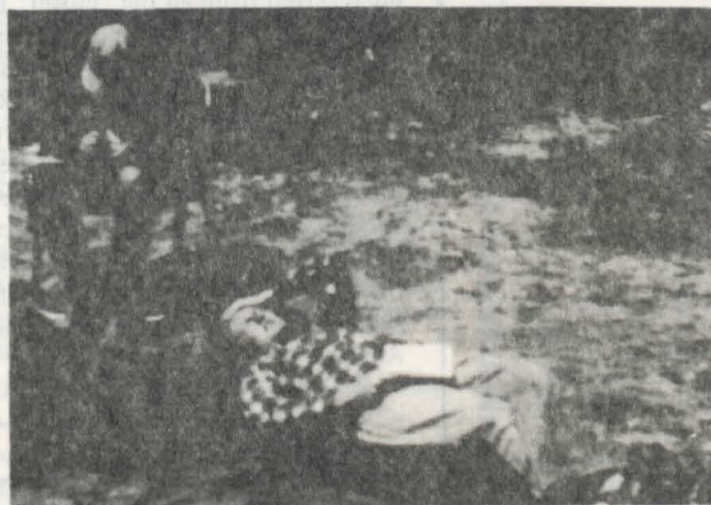
FREE BEER and Gay skits highlighted the first annual North Texas Gay Pride picnic held last month at Queen's Point on Garza-Little Elm Reservoir north of Dallas. Skits were per-